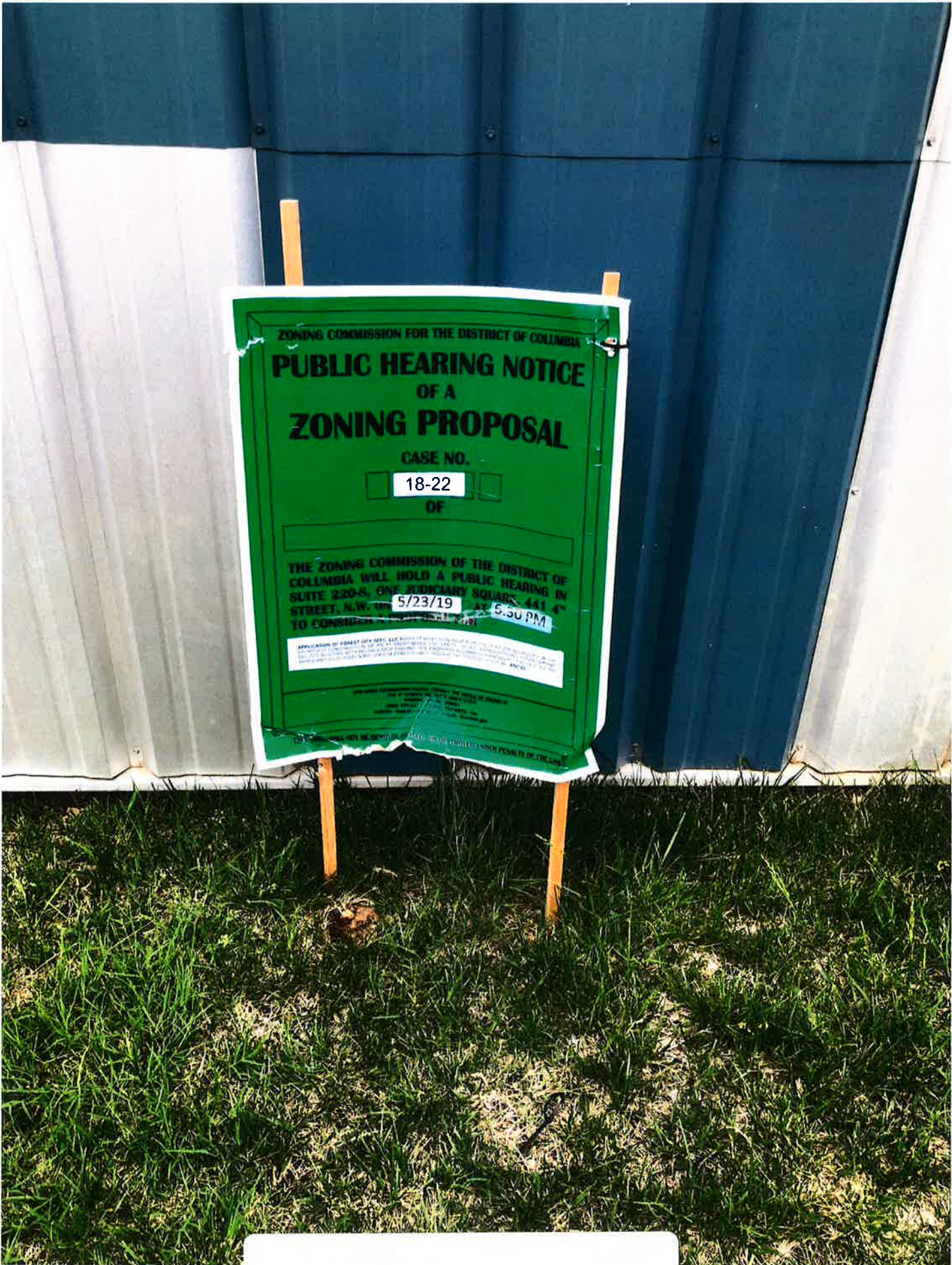
5/8/19 New Jersey Ave SE