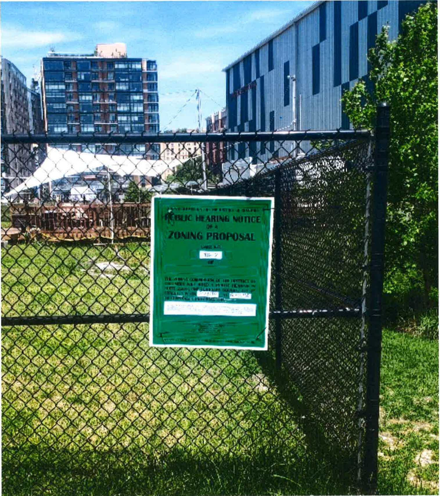
5/15/19 N STREET SE