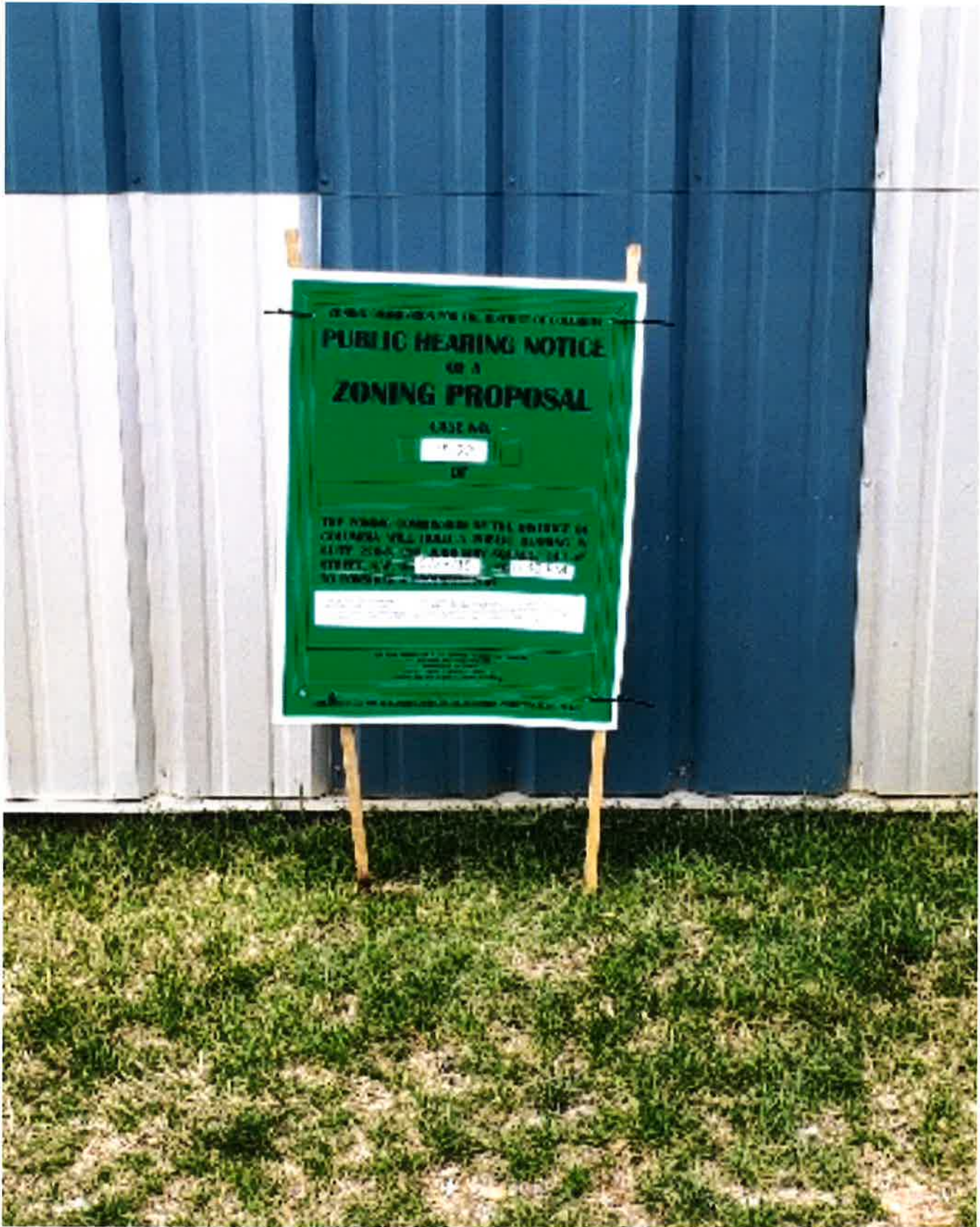
4/16/19 New Jersey Ave SE